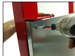
Details # 2